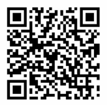
Table sponsorship and individual ticket information available at academyofsciencestl.org/awards/

Reception: 5:30pm Dinner: 6:15pm Followed by awards ceremony business attire